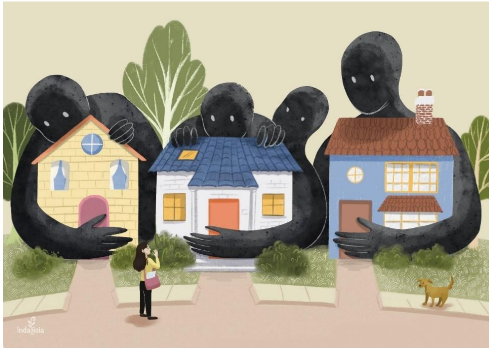
Figure 6. Claudia Silva, a look at irregular migration.

The author of Figure 6 says the following about the production process of this illustration: